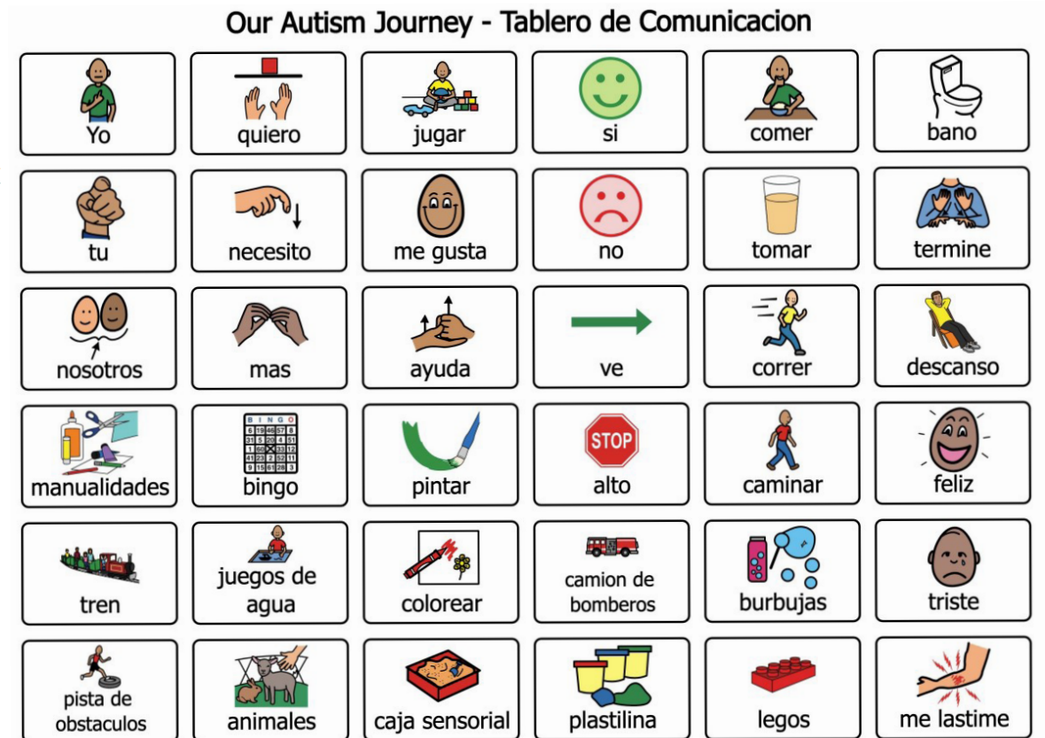
Our Autism Journey - AAC Communication Board

Este panel es una herramienta de comunicación. Al señalar símbolos, fomenta la comprensión y las expresiones. En el caso de los niños, hacer que los adultos señalen los símbolos mientras hablan puede ayudar a desarrollo y expansión del lenguaje.